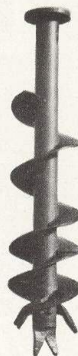
4 in & 6 in